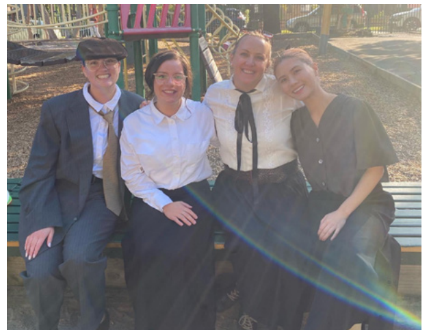
ON PARADE: TEACHERS AND STUDENTS ALL ENJOYING GETTING IN CHARACTER AND PROUDLY PARADING THEIR 1920/30S COSTUMES.