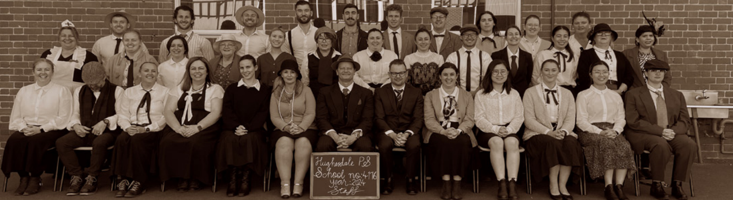
HPS TEACHING AND SUPPORT STAFF 2ND MAY 2024

On Thursday 2nd May, we celebrated our 100 year anniversary and the concealment of our centenary time capsule with a dress up day and special assembly.