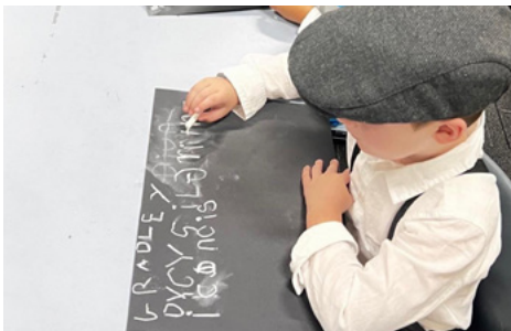
Centenary Dress Up Day