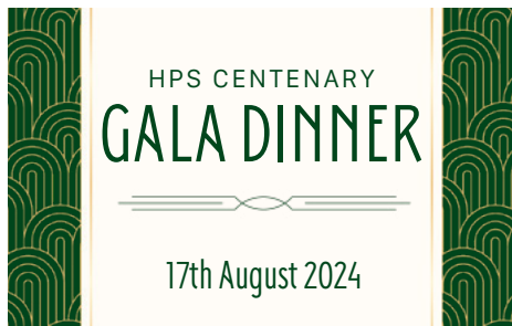
Gala Dinner - Book your tickets