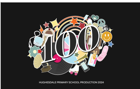
'100' Production - Thursday 25th July