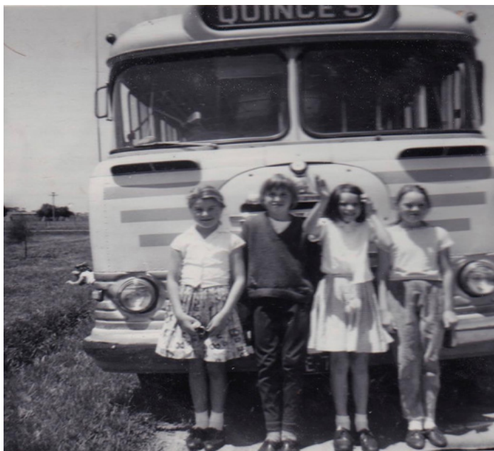
LEFT: WERRIBEE FARM EXCURSION 1965