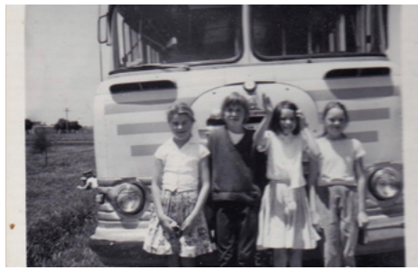
Reflections and Memories