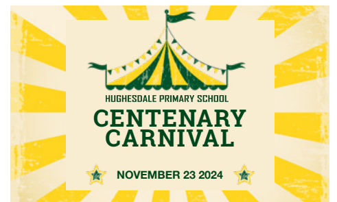
Centenary Carnival - Save the Date